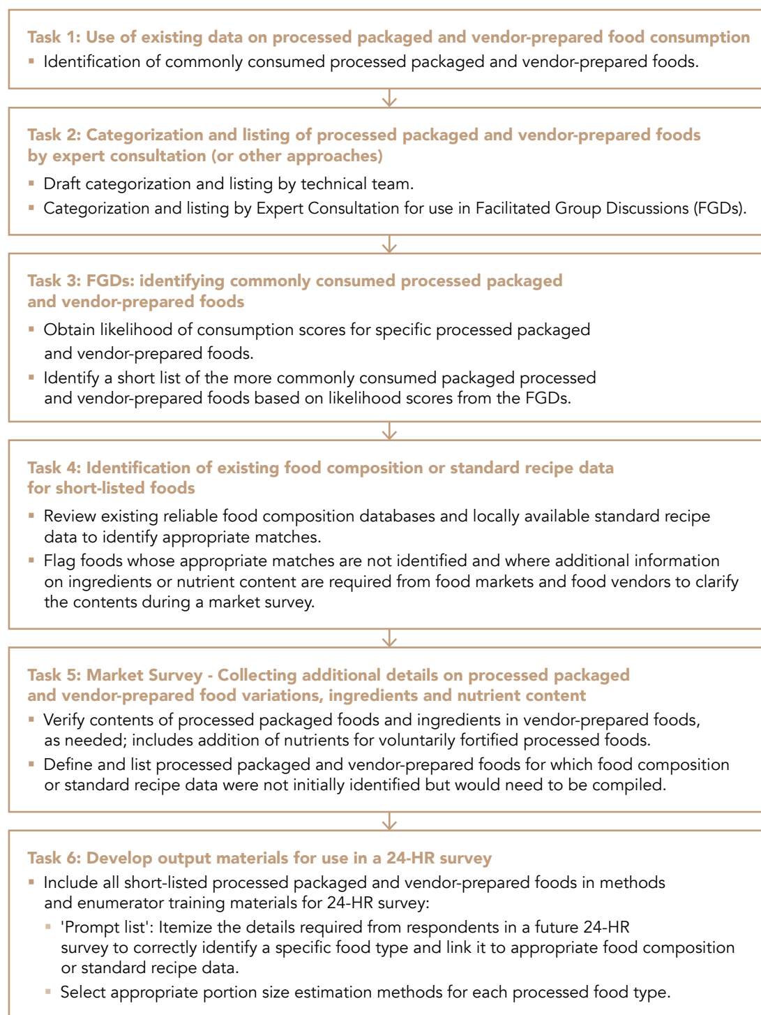
Figure 1. Summary of tasks in the urban food listing activity for processed packaged and vendor-prepared foods.